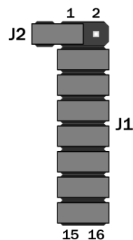
MON08 Connector Jumpered for Standalone Mode Operation

In order for the IDB-HC08AP Evaluation Board to work in standalone mode, the MON08 connector's pins must be jumpered as shown below (factory setting).